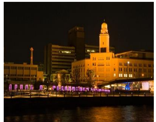
Yokohama 3 Towers/

URL : http://trip.pref.kanagawa.jp/about_area01.html