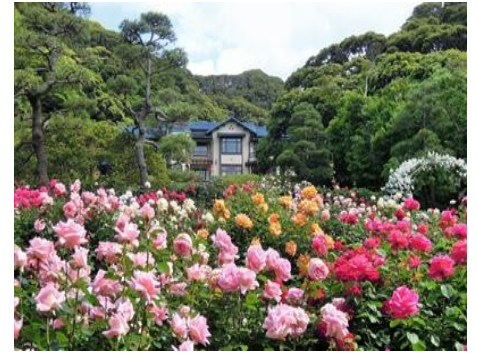
Rose garden /

URL : http://trip.pref.kanagawa.jp/course_detail.html?id=403