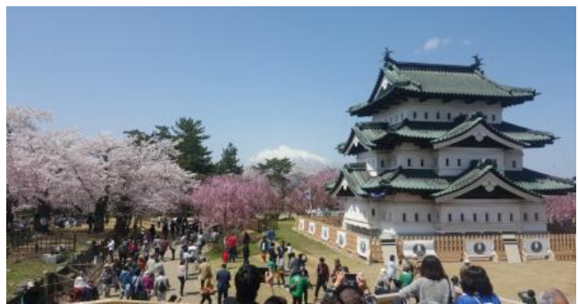
Hirosaki Castle

Bus fare, Hirosaki Park admission fee (Honmaru /Kitano kuruwa area), English-speaking assistant fee