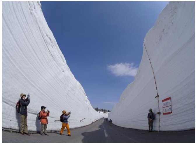
Hakkoda Snow Corridor