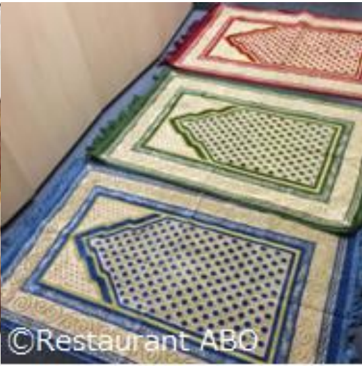
* Prayer rugs available for rent.