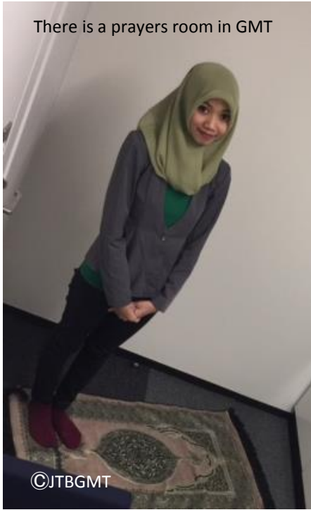
Hokkaido FAM, hosted by JTBGMT (familiarization tour for Indonesian Travel Agents and Media)